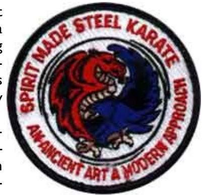
Dojo Patch from Spirit Made Steel in Madison, Alabama.

The next dojo is the Eagle's Wing Karate located at 8006 Old Madison Pike. Eagle's Wing Karate works with local churches and non-profits to help people find others who share interest in the martial arts. Again, most of their classes take place on Tuesday and Thursday, so if your are in Madison, run from Spirit Made Steel to Eagle's Wing Karate and get your work out on.